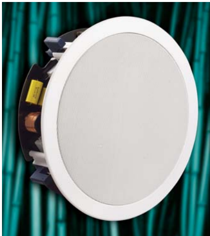
565MP with grille