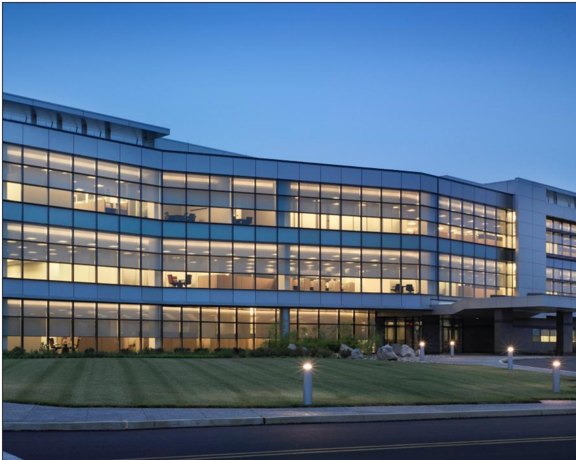
The importance of IHA - aligned shades create clean lines

IHA is the most advanced system for controlling shade movement and maintaining hembar alignment that is currently available. It is just one of the features that makes Lutron shades the most precise and most customizable shading system in the world.