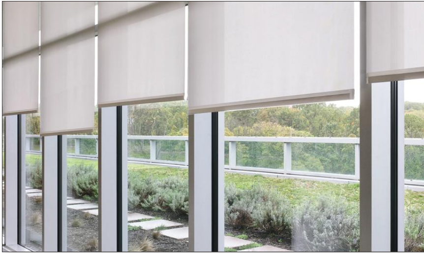
Industry standard - shades misalign over time