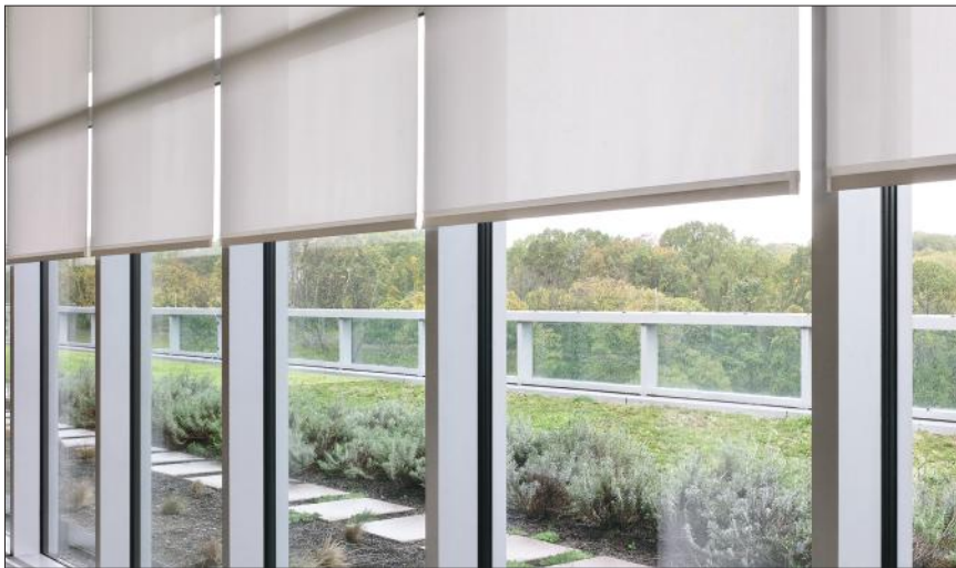
Standard IHA - keeps shades aligned

Standard IHA: All Lutron shades are pre-calibrated to run at the same drive speed before leaving the factory. In most installations shades will be aligned within 1/8”.