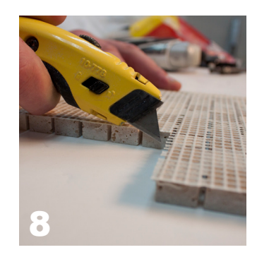
Cut tile - grinder or tile saw may be needed to cut individual tiles.