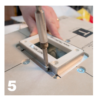
Fasten the tile dam using the four mud dam screws. Be sure to use a low torque setting so that the tile dam is not distorted. Also, if longer screws are needed, any standard #6 pan head screw can be used.