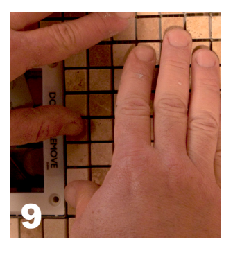
Set tile - being mindful of keeping an equal grout line around device.

Once tile is set, grout can be applied using standard industry practices. Be sure to make sure the grout around device remains clean and even.