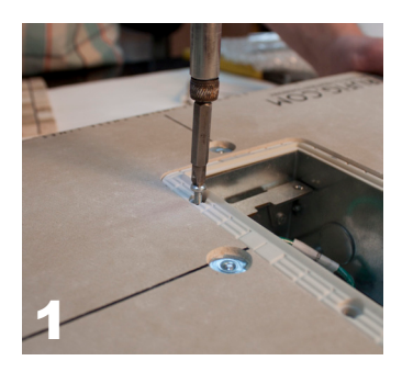
Remove the mud dam from the mounting platform

Note: small tile install is applicable to IG and 2G platforms only because these are the only sizes where a mud dam is currently available.