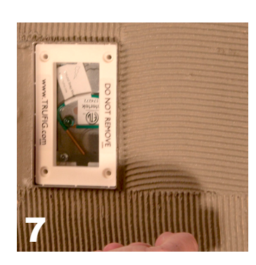
Apply desired notch trial finish