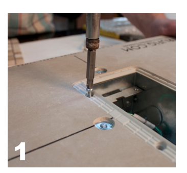
Remove the mud dam from the mounting platform

Notes: plaster shims are 1/16" thick. If longer screws are needed, any #6 pan head screw will work. Also, adding plaster shims can be done before or after the platform is installed.