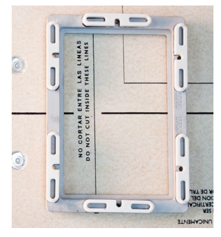
Adhere one stack of shims to each mud dam screw location